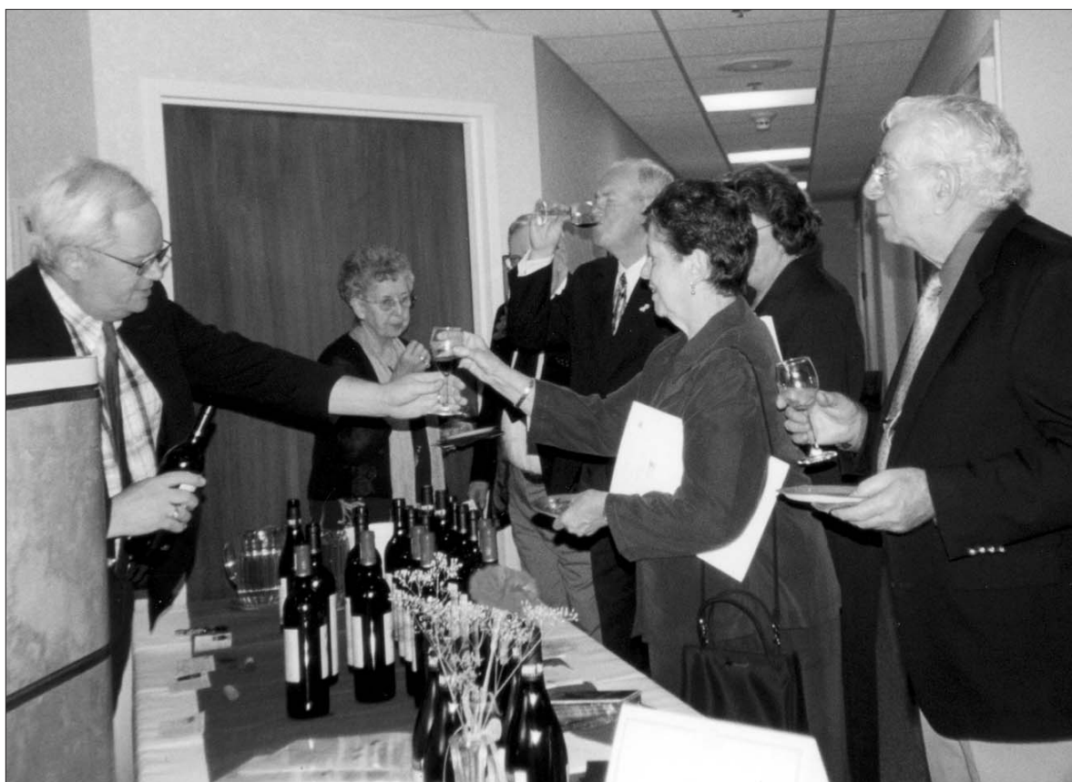
Guests at Phoenix Community Cancer Center's Wine Tasting enjoyed sampling fine wines from around the globe as they mingled with friends.